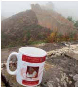
Where in the world?