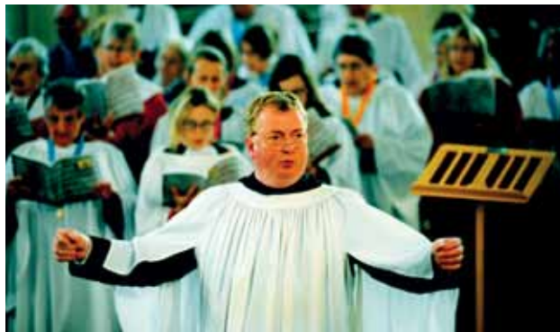
RSCM Celebration Day

Welcome to the new look FOCC newsletter! May I take this opportunity of thanking you most warmly for your support of the FOCC, either by your annual subscription, membership of the 500 Club or by offers of practical help at special events. If you are reading this and are not currently a member, please consider becoming one!